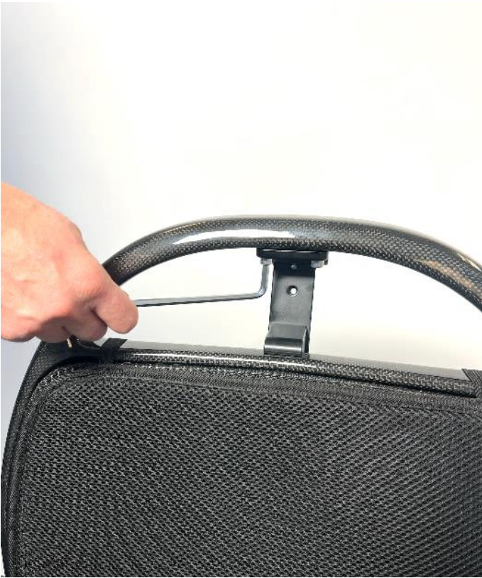
1. Place the mounting bracket onto the backrest from behind and align with the holes. Tighten the two screws with a hex key. NOTE: Be careful not to overtighten due to the nature of carbon fiber material.

The C3 headrest can be mounted directly on the C3 backrest, or onto the C3 assistant handles.