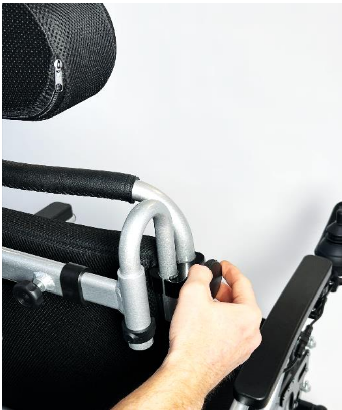
1. Firmly fasten one side of the headrest onto the backrest by using the mounting clamp.

The headrest can be adjusted in most directions and comes with a quick lock function for transport removal.