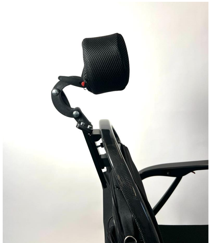
4. Fine-tune the position (front/back, up/down) of the headrest with the three levers at the back.