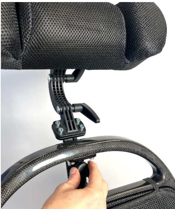
3. The central locking knob is used to fix the headrest at the desired height, and to remove the headrest during transport if needed.