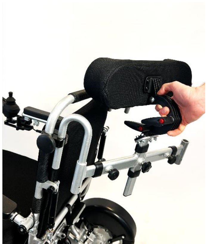
6. Slide the headrest frame downwards.