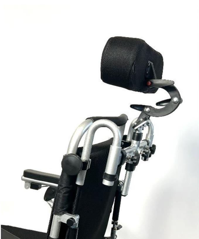
3. Make sure the assembly is straight and level, then tighten the mounting clamps firmly.