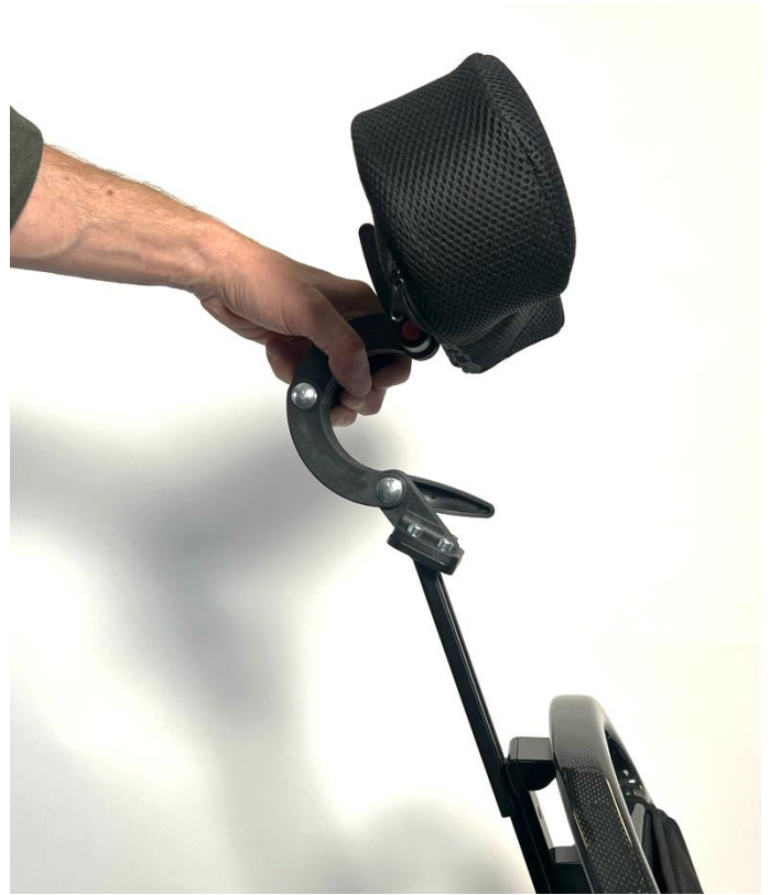
2. Slide the headrest onto the bracket from above.