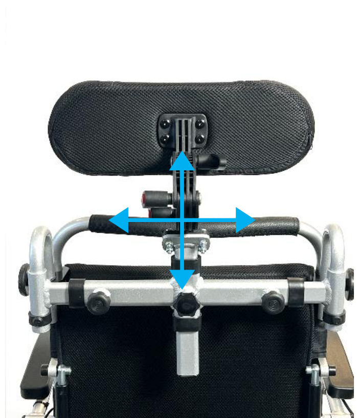
4. If desired the base position of the headrest can be now adjusted sideways or up/down with the 3 adjustment knobs. Tighten firmly.