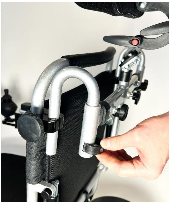
5. The quick lock pins can be used to remove the headrest during transport.